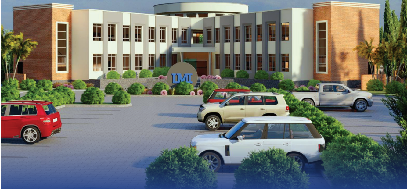
Mbale Centre artistic impression