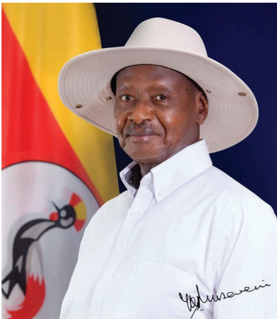
H.E. Gen. Yoweri Kaguta Museveni President of the Republic of Uganda