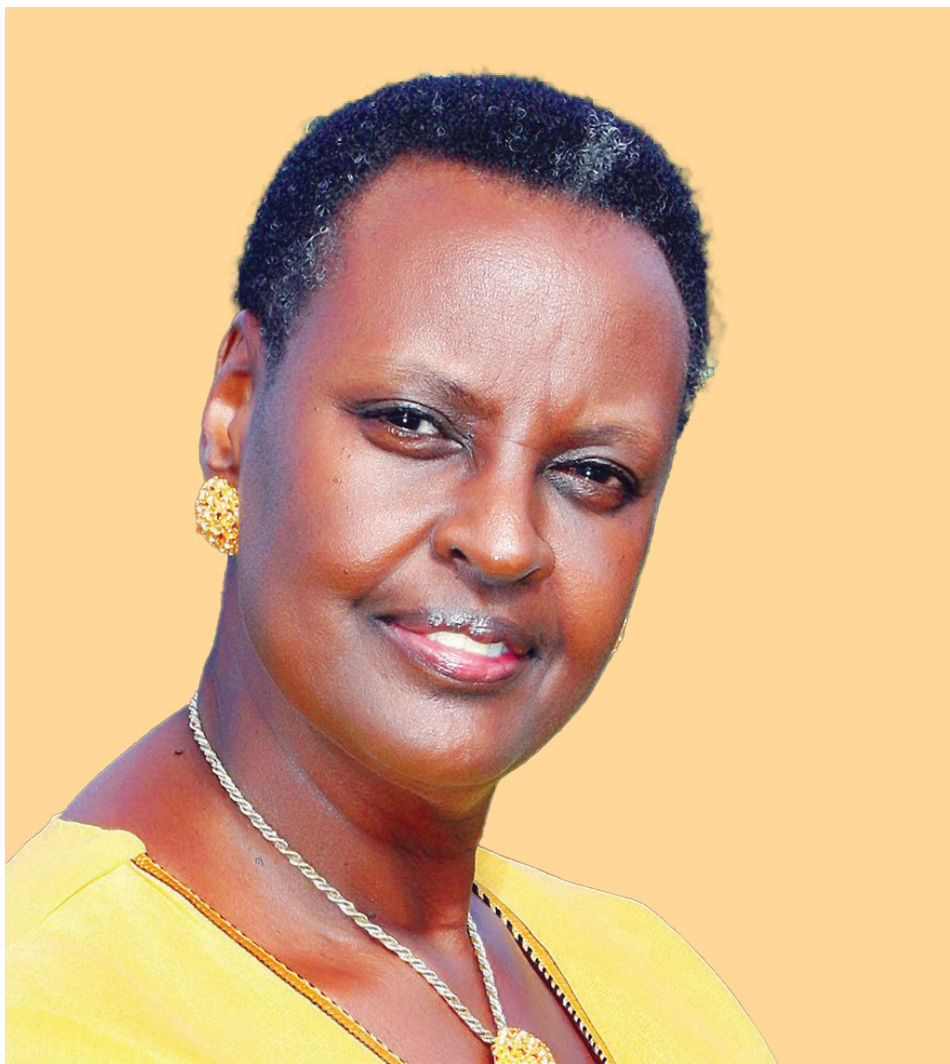
Hon. Janet Kataaha Museveni Minister of Education and Sports