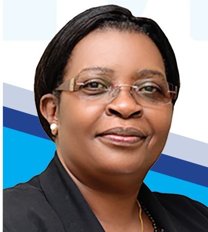
Rt. Hon. Dr. Margaret Nantongo Zziwa Vice Chairperson UMI Governing Council